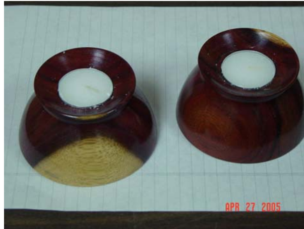
Charlie White's turned Candle Holders