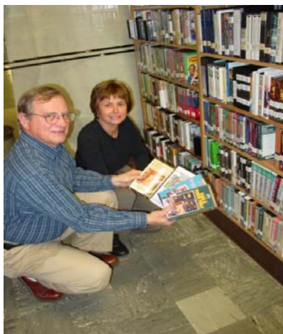
A sample of the 67 videotapes funded by SDFWA, which are available at the SD Public Library