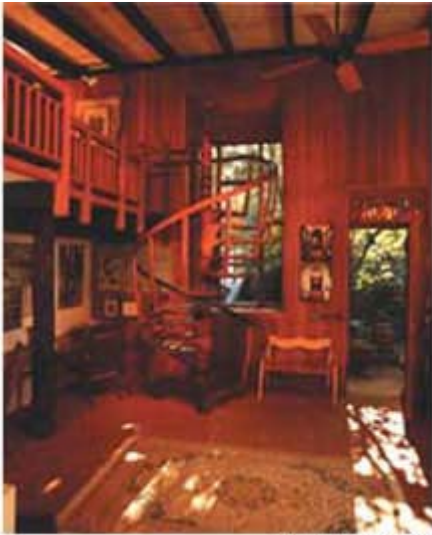
Sam Maloof's home