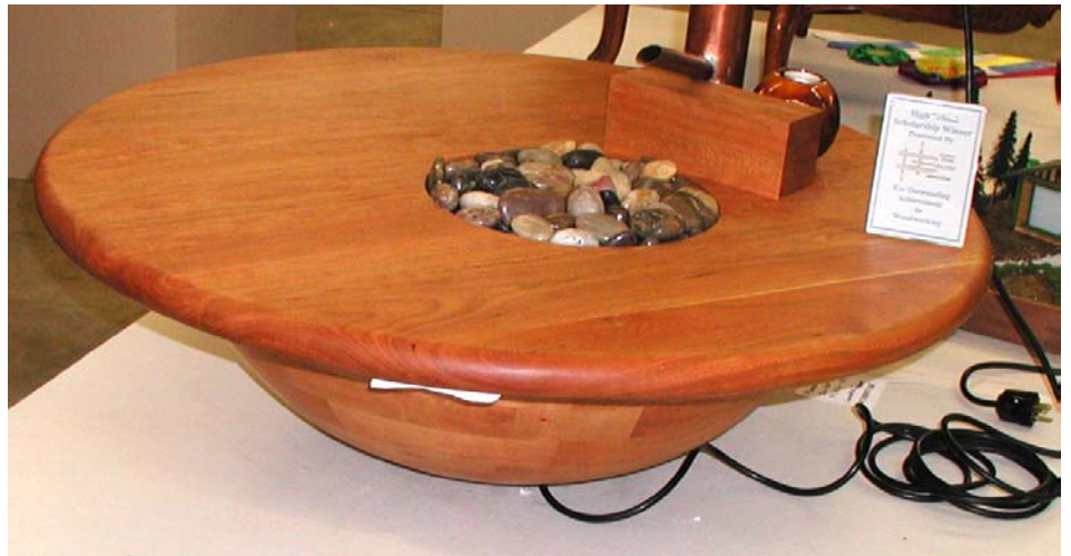
Nick Platis Cherry Waterfall San Dieguito Academy